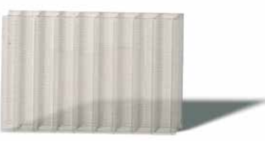
Sample 1: \Delta Yi = 0

Please consult your local distributor or SABIC's Innovative Plastics Sales Office for more details.