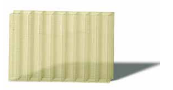
Sample 3: \Delta Yi = 10: Typical polycarbonate multiwall sheet warranty