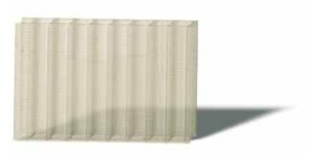
Sample 2: \Delta Yi = 2 : LEXAN THERMOCLEAR sheet warranty