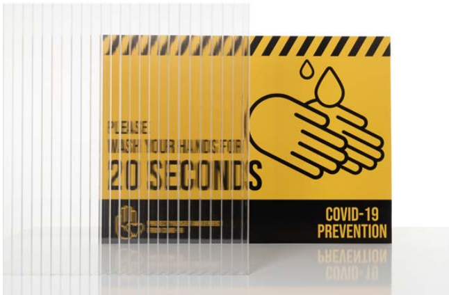
High Clarity Multiwall Sheet Structure