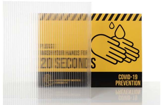
Standard Multiwall Sheet Structure